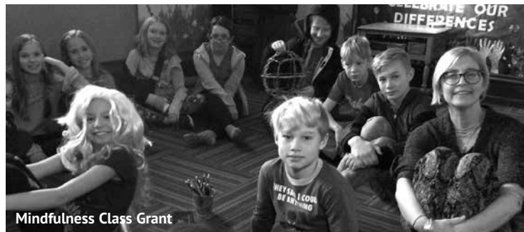
Mindfulness Class Grant

Mindfulness / Manitou provide mind – body health and wellness training and programming for Winona-area children and adults so they can better care for their own mental, emotional and physical wellbeing.