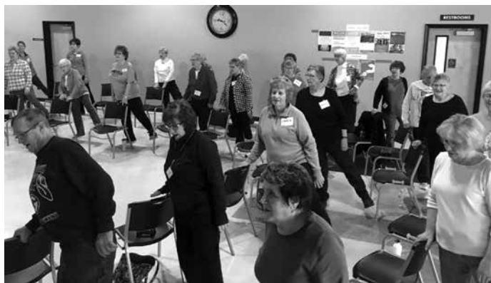
SAIL /CC of Winona

Stay Active and Independent (SAIL) / CC of Winona purchased exercise equipment to support an increased demand in participation in the free exercise program. This volunteer-led exercise program is proven to enhance the health and social connectedness of older adults.